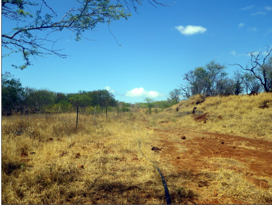
Figure 5. Route of the proposed waterline, southeastern segment of the corridor, facing north. The waterline will follow the fenceline on the left of the rough dirt road.