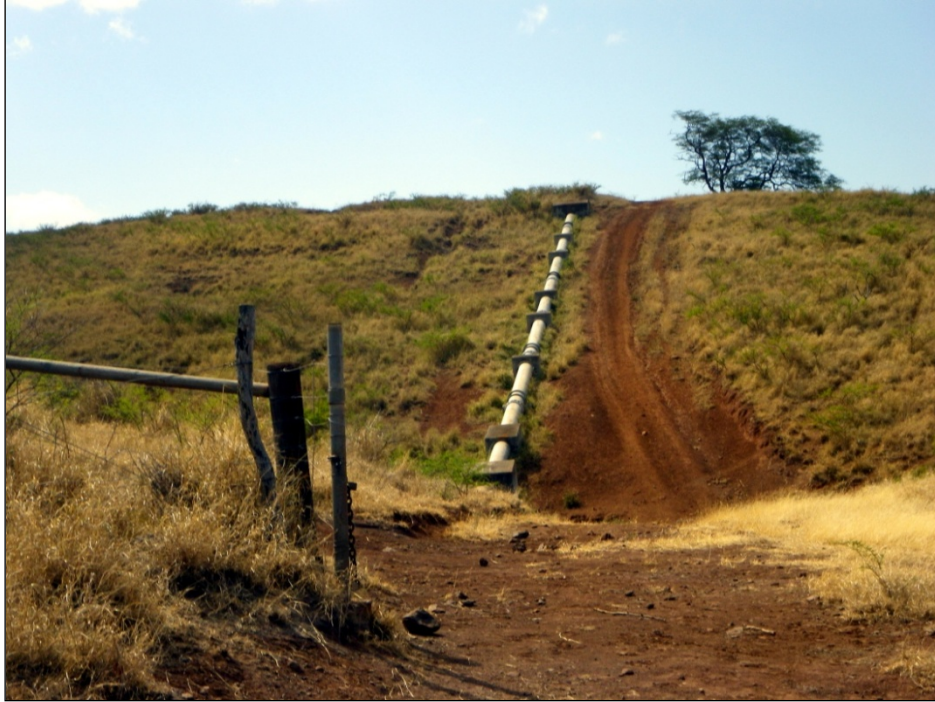
Figure 3. Eastern segment of existing waterline, through ranchlands south of Pu‘u Luahine. Note that the waterline parallels the dirt road. View is to the east.