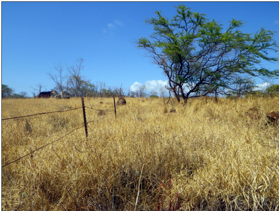
Figure 6. End of the fenceline in the eastern segment of the proposed waterline corridor. The waterline continues northeast here. View is to the north.