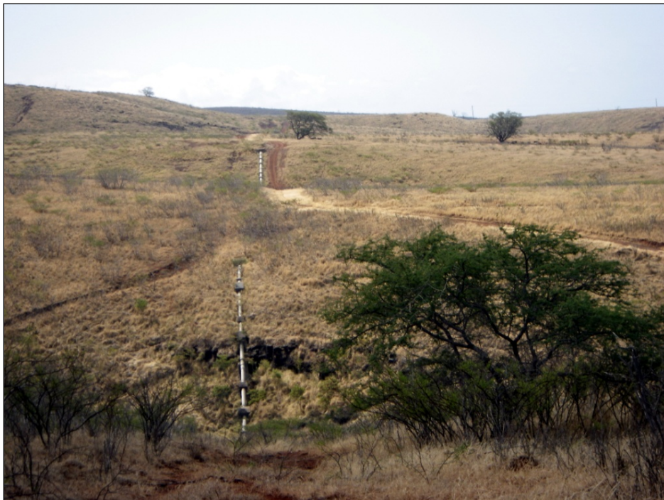
Figure 4. Eastern segment of existing waterline, through ranchlands south of Pu‘u Luahine, where the waterline crosses a gulch. View is to the east.